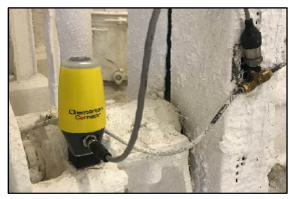
Chesterton Connect attached to slurry pump.

Based on these findings, the staff was able to make corrections to the work schedule, increasing overall reliability. The pump is running successfully without failures.