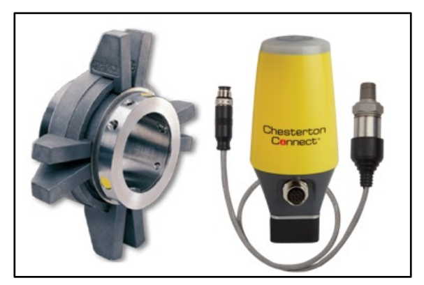
Chesterton 155 Seal with SpiratlTrac and Chesterton Connect.