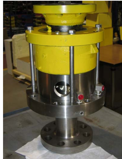
Figure 1 – 280M Dual Mechanical Seal with Bearing